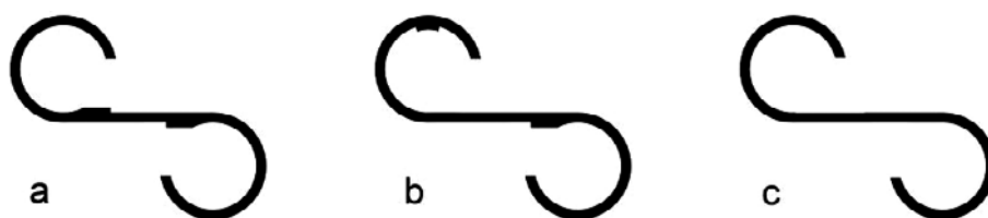
Fig. 1 Original target figure (a) and the two figures that were slightly different from the target figure (b, c).

with the criteria of ultra-high-risk patients.